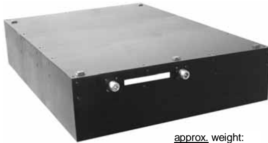
approx. weight: 24.5 kg (54 lbs)

Model Number: WRCA 824/894-812/906-50/12HH-1000 (= 7/16-F Connectors)