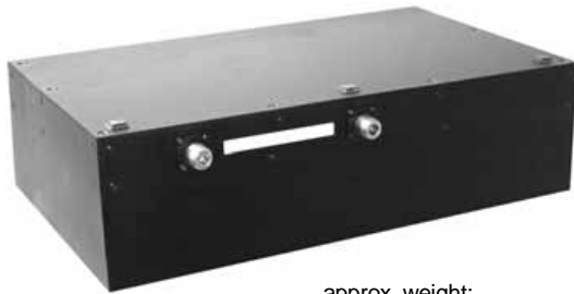
approx. weight: 12.5 kg (27.5 lbs)