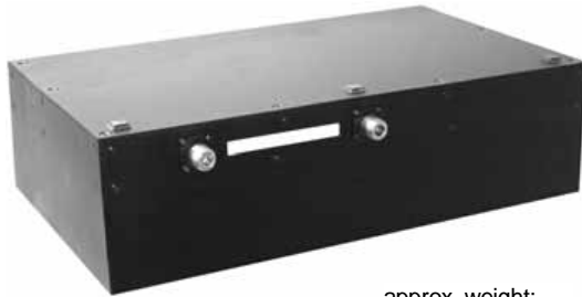
approx. weight: 18.5 kg (40.7 lbs)