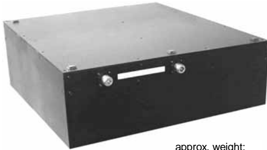
approx. weight: 18.5 kg (40.7 lbs)