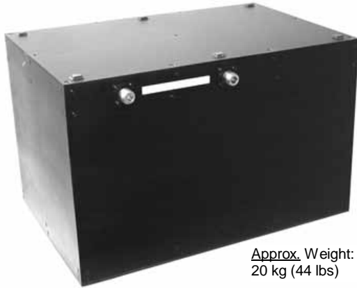
Approx. Weight: 20 kg (44 lbs)

Model Number: WRCA 314/316-312/318-50/6EE-250 (= N-F Connectors) WRCA 314/316-312/318-50/6HH-250 (= 7/16-F Connectors)