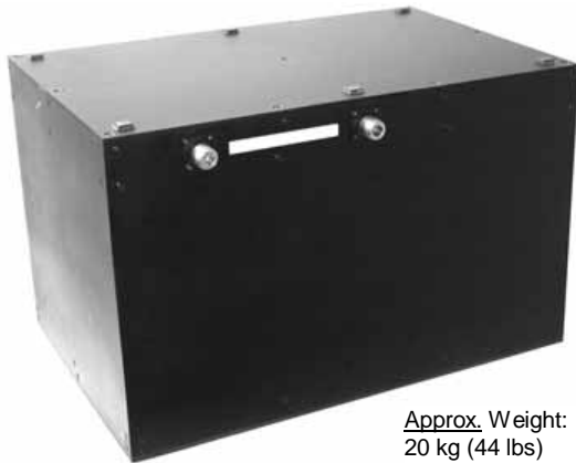
Approx. Weight: 20 kg (44 lbs)

Model Number: WRCA 314/316-312/318-50/6HH-1000 (= 7/16-F Connectors)