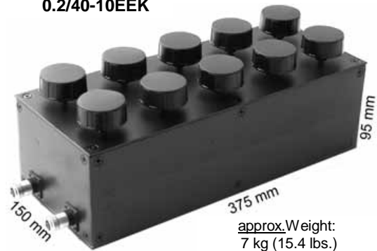
Available with Tuning Knobs or Screwdriver Tunable

This filter will produce up to 10 notches in the passband. The notch F_o is determined by the user by tuning each resonator. Each notch is very narrow and has 5 to 10 dB reject attenuation. Several notches can be combined by tuning them to the same frequency. This increases the notch depth and width. Attenuation will be greater at the low end of the tuning range and less at the upper end. The filter is designed to produce a 200 kHz bandwidth with at least 40 dB reject attenuation when all notches are tuned to 1080 MHz. The temperature specification of +15° to +40°C applies to this frequency and stability decreases away from the center towards both ends of the range. Each filter is tested over the full range and 4 curves (as shown above) are supplied on delivery.