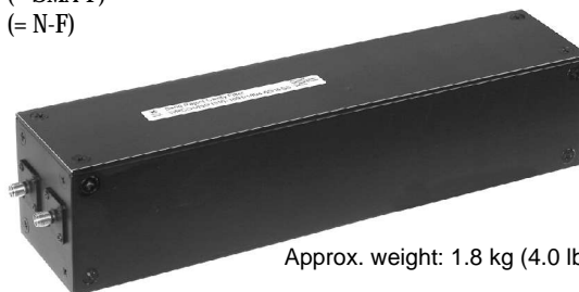
Approx. weight: 1.8 kg (4.0 lbs.)